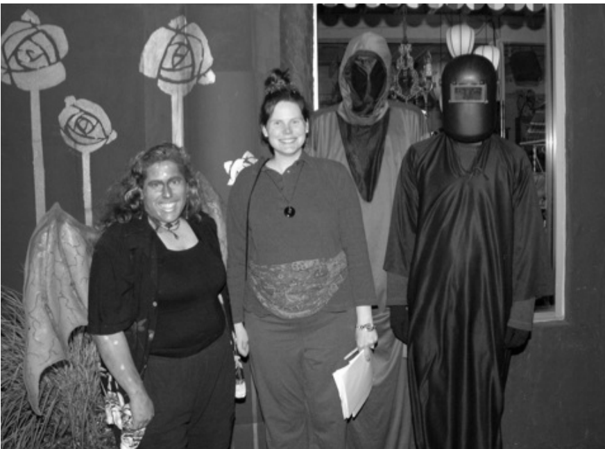
Editors celebrate: Handbook staffers gather for the publication's release

The Mooncurser's Handbook is the foremost authority on what's hot or not anywhere in the galaxy. From its modest beginnings as a simple travel guide, the Handbook has become the touchstone of an entire cultural movement and lifestyle philosophy, and the center of Galactic Consortium's extensive financial empire. The forty-second edition of the Handbook is widely expected to be the best-selling publication in history, exceeding even 5 Low-Carb Ways To Get To Heaven and If I Wanted a Jihad, I'd Have Sent You an Engraved Tablet by God.